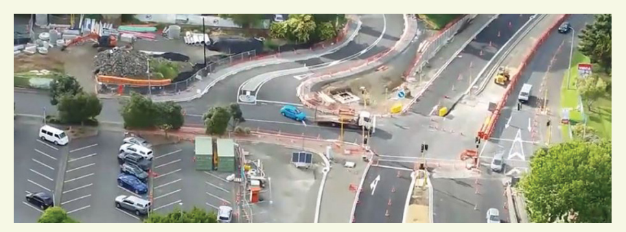
Eastbound traffic is using the new busway, which allows work to continue along the centre of Lagoon Drive.

These images highlight how the busway is progressing towards completion.