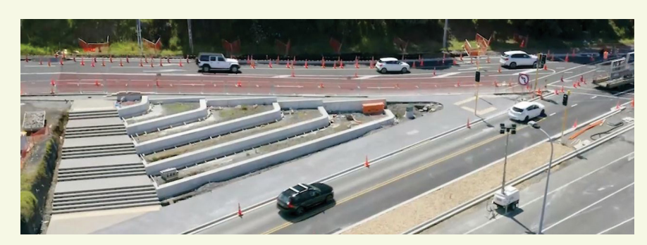
The new retaining walls on the corner of Church Road and Lagoon Drive.