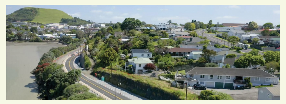
Looking west along Lagoon Drive with Mount Wellington in the background.