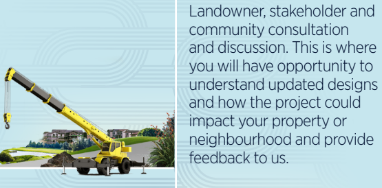
Late 2021 Consenting process expected to begin.

Enabling construction work begins. Main construction starts in sections.