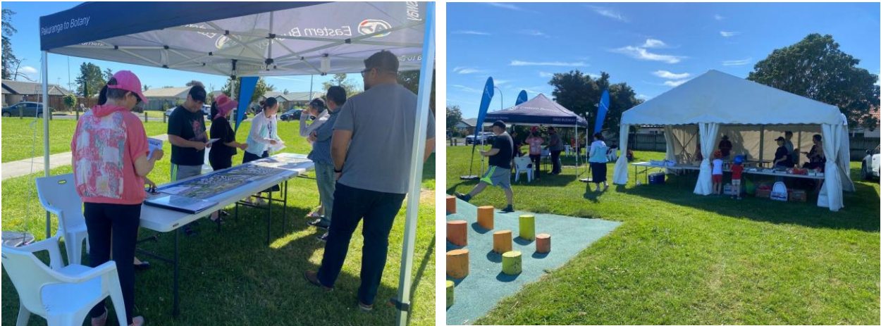
Figure 5 and 6: Photographs of the Burswood Park community consultation event on Thursday 5 December