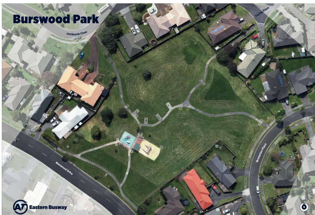
Figure 1: Aerial plan of Burswood Park used as consultation collateral at the community event

There are five interconnected concrete footpaths that create links to and from Burswood Drive, Fernbrook Close, Foxley Place and Brompton Place. The park is well used by people walking their dogs and is visited by families with children to use the playground. Burswood Park offers access near the southern park boundary to the Burswood coastal path that runs along the suburb's perimeter.