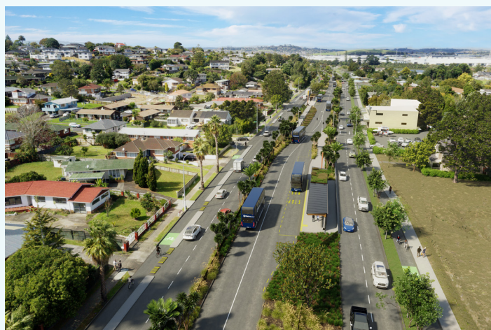
Artist impression of the completed busway and Edgewater Station on Ti Rakau Drive

You're welcome to contact the alliance to give feedback, sign up to receive the latest busway news, and visit our website to find out more about the project.